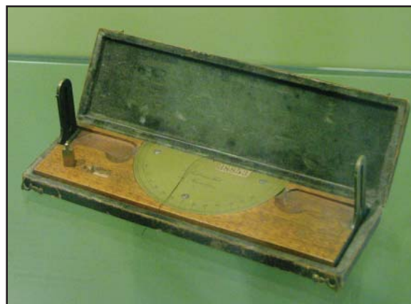
Figure 4: Hand- held inclinometers from Germany were on display in the cartography section in the Deutsches Museum. The one shown was made in Munich around 1860, and with this instrument it would be possible to align the case along a string between stations or use the flip-up alidade sights.

happen with compass surveys, and instead the hope is that the error is within reason. According to Max's journal, they mapped Gothic Avenue on March 11, Corkscrew on March 15, and Lost Avenue on March 19. The journal does not provide a complete record of mapping activity, so presumably the survey of Gothic Avenue was followed by Gratz Avenue and Wilson's Way, so that when Lost Avenue and Harvey's Way were surveyed, a loop was completed via Main Cave at Acute Angle to Booth's