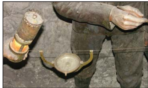
Figure 2: A mine survey display at the Deutsches Museum showing the use of a string mounted compass.

For the smaller side passages, where a larger string-mounted compass would be impractical, there were more compact